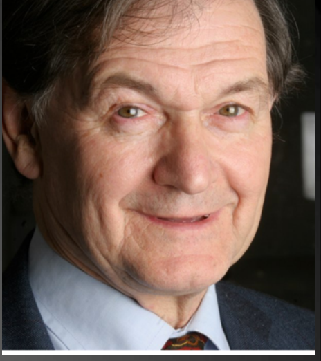
Born: Aug 8, 1931